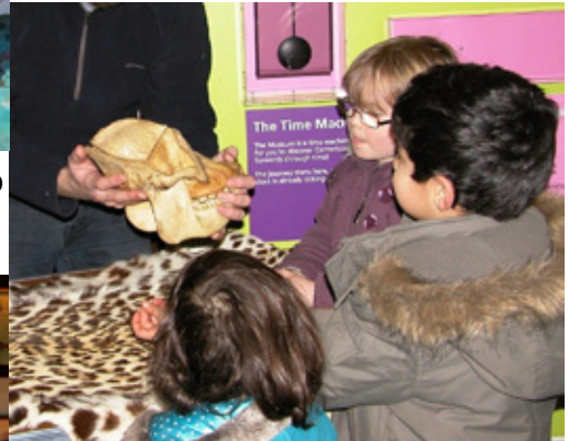
Skins and skulls object handling