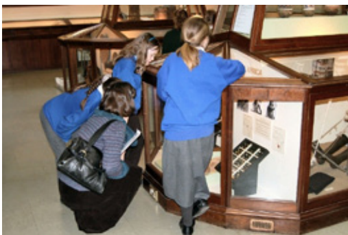
On a museum trail