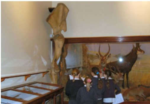
Estimating the size of an elephant. Maths cross-curricular session in the galleries.