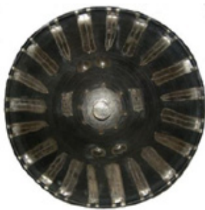
South East Asian Shield Corridor Gallery