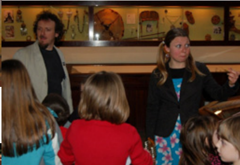
Storytelling in the Galleries