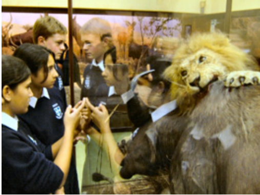
Secondary School visit looking at 19th Century history