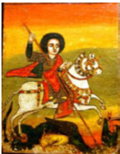
St. George Gallery Two