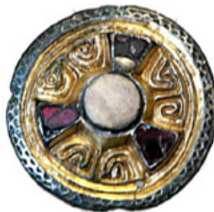
Anglo-Saxon Brooch Archaeology Collection