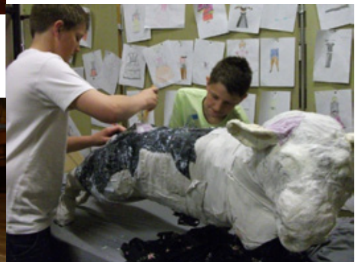
Model making in an artist led workshop