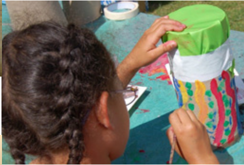
Drum making after a music workshop