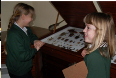
Minibeasts in the galleries followed by minibeasts in the garden