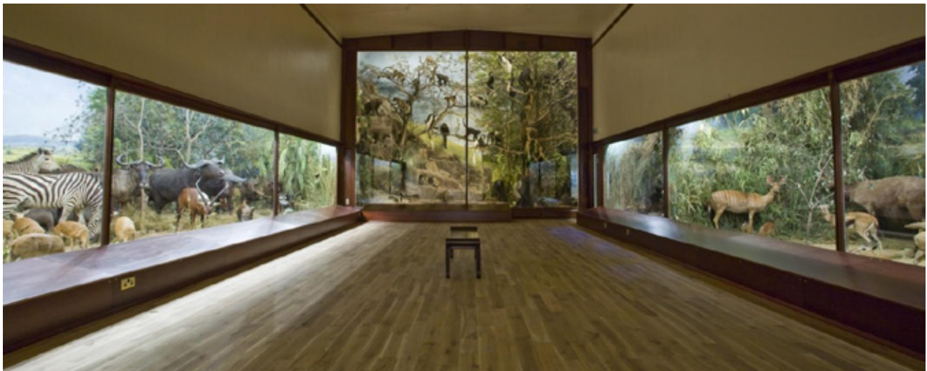
Gallery One. Lit up display by display as part of the museum introduction