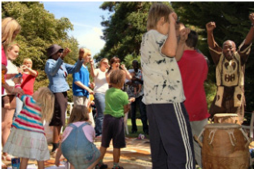
Drum and dance in the gardens