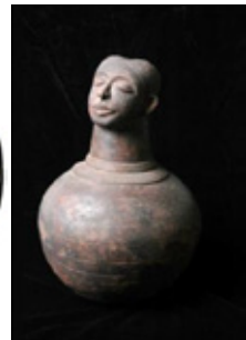
Mbitim pot Azande Collection