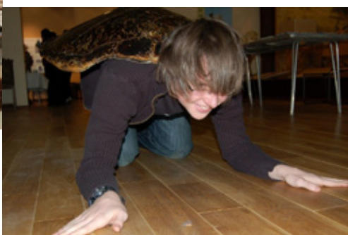
He loved being a turtle